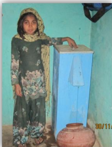
Figure 2 Conventional Biosand Filter design

transportation of the heavy filter on bumpy rail roads. It makes it difficult and risky to transport in remote or hilly rural locations. Issues in portability due to weight (75 Kg), low rate of production due to need of mould for casting, and quality control in production of concrete bio-sand filters-- triggered Sehgal foundation to design and develop bio-sand filter in another material.