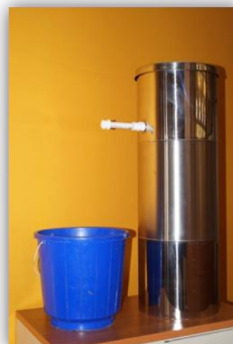
Figure 1 Newly developed JalKalp Filter

Prototypes of biosand filter in different materials including plastic, fibre glass, galvanized